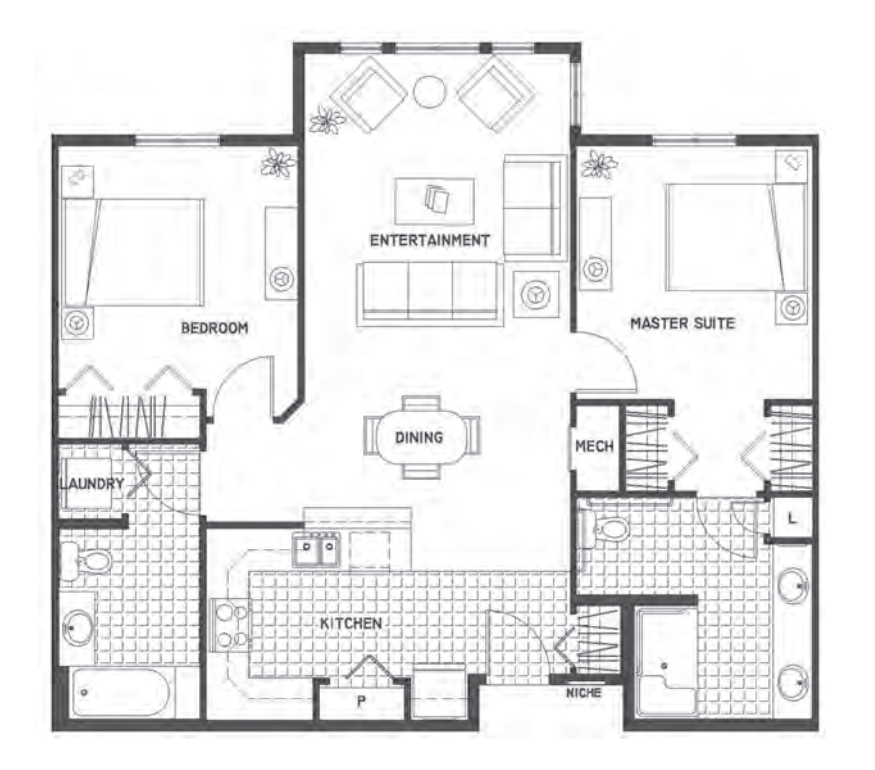
Magnolia 1,052 Sq. Ft.